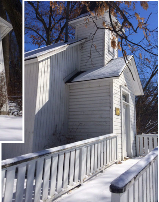
Scandia Chapel

Bring your yard clean up gear and tools. RSVP to Jacque Waugh at: jacqwaugh@gmail.com . 952-446-1175