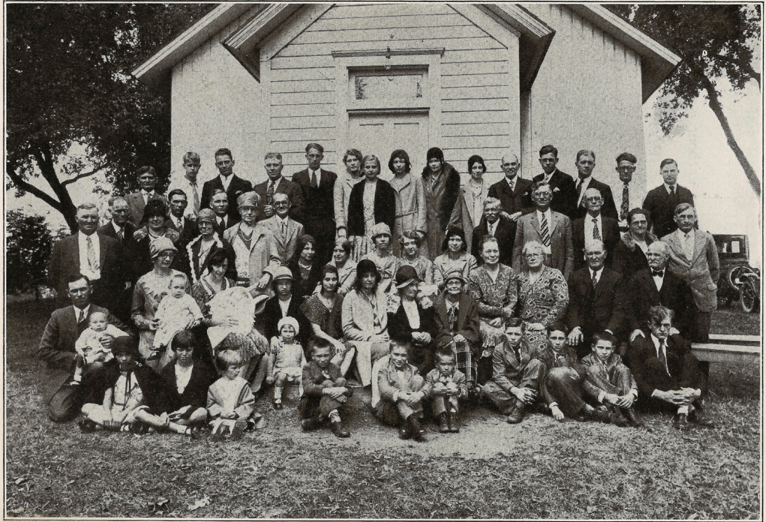
Congregation and Sunday School